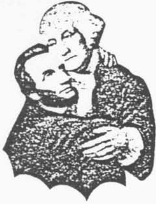
© H. C. HILL U. S. AND CANADA 1986 PLANT DESIGN